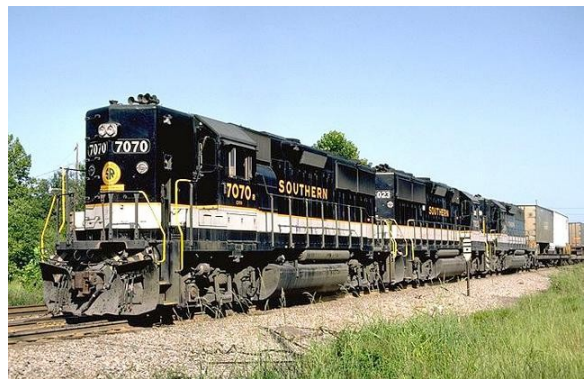
Southern GP50s at Chula on the GS&F