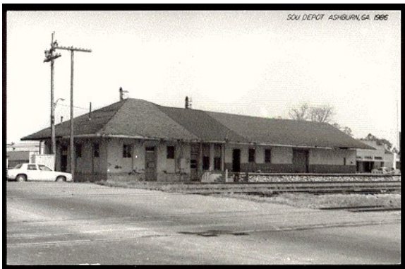
Ashburn, Georgia Depot (G85)